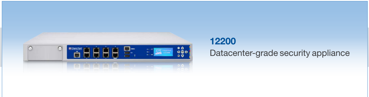
12200 Datacenter-grade security appliance