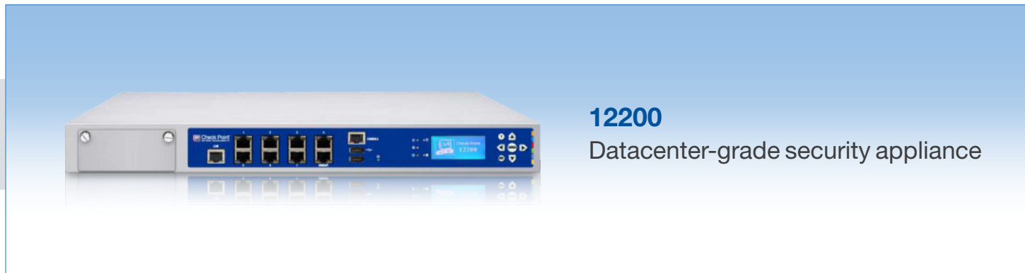
12200 Datacenter-grade security appliance